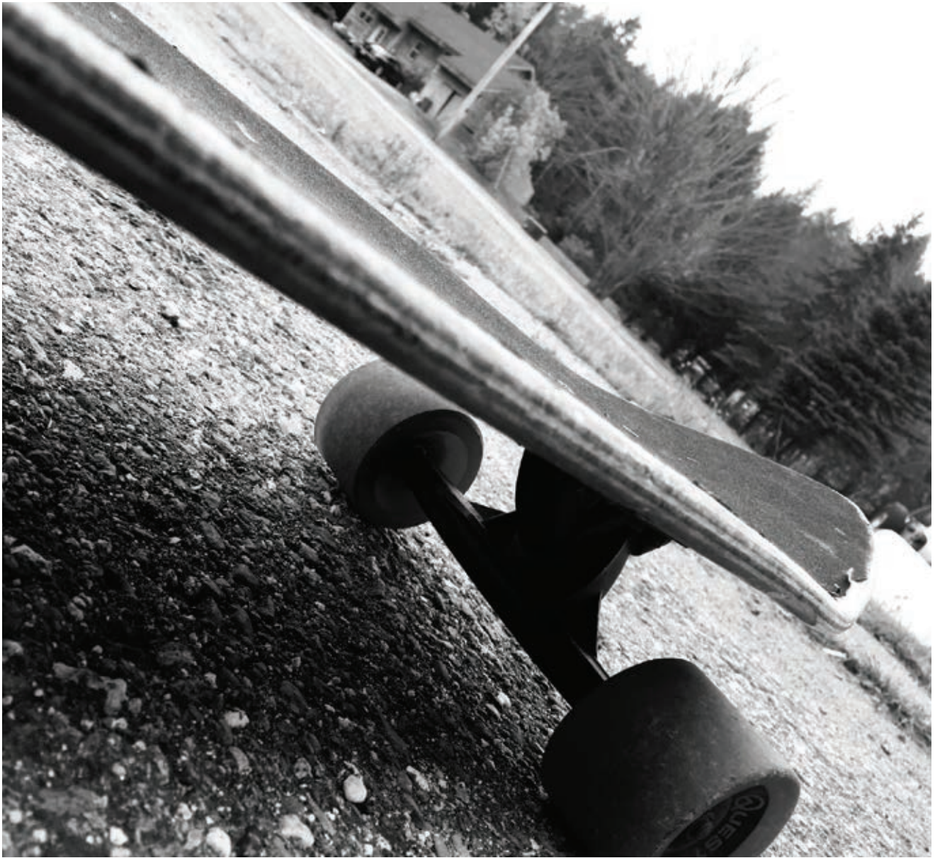
THE LONELY STREET Digital Photography Wiphun, Passamaquoddy Indian Township School