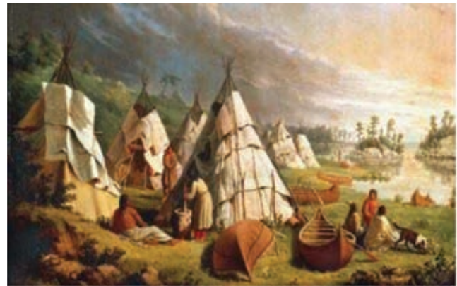
Graphic 3. Sample Stereotypical Depictions of Indigenous Peoples and Homes

includes stereotypical illustrations of Native peoples, homes, and regalia in a variety of educational materials. Examples of such depictions are below: